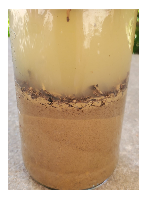
Step 4 Determine the types of soil found in your sample.

STEP 2 Take a scoop of soil from 3 to 4 areas in your yard.