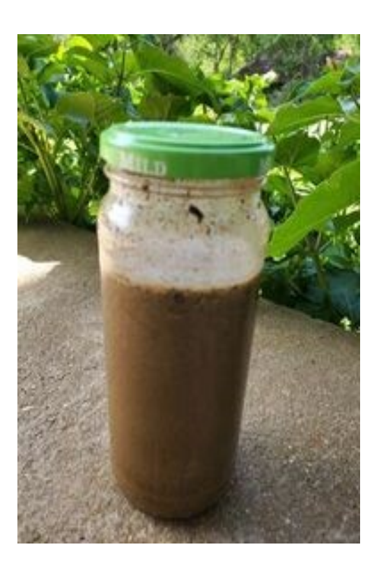
STEP 3 Fill with water about 3/4 full and Shake. Let the jar sit for several hours.

STEP ! Get a clean jar. A recycled jar will work.