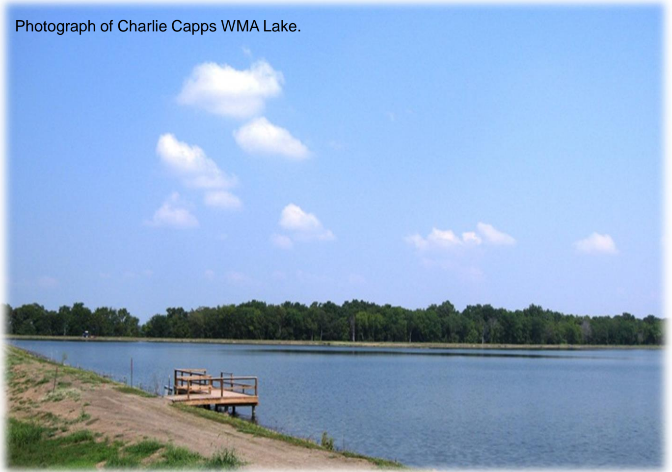
Photograph of Charlie Capps WMA Lake.