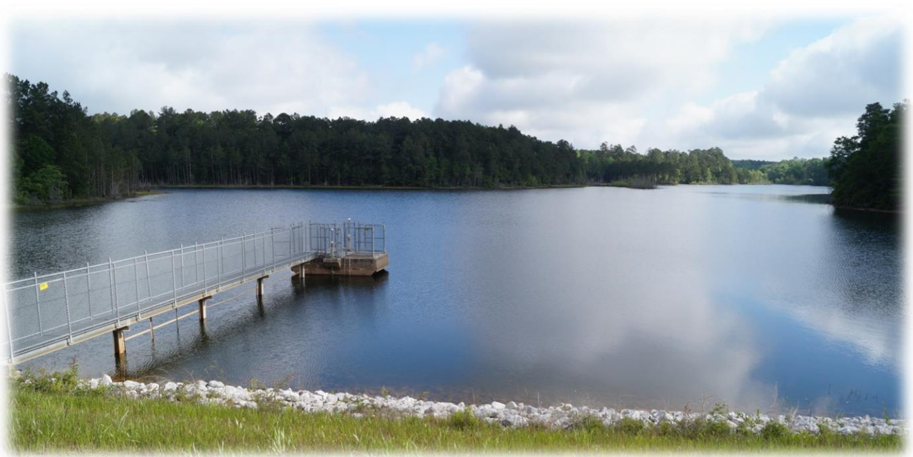
Above: View of Lake Walthall from the dam.

Right: Summary of the total numbers of adult fish (Largemouth Bass – LMB, Bream – Bluegill, Redear Sunfish, Longear Sunfish, Warmouth) sampled per mile during 2016, 2017 and 2022 fall electrofishing. Even though electrofishing catch rates have fluctuated, anglers continue to catch high numbers of fish.