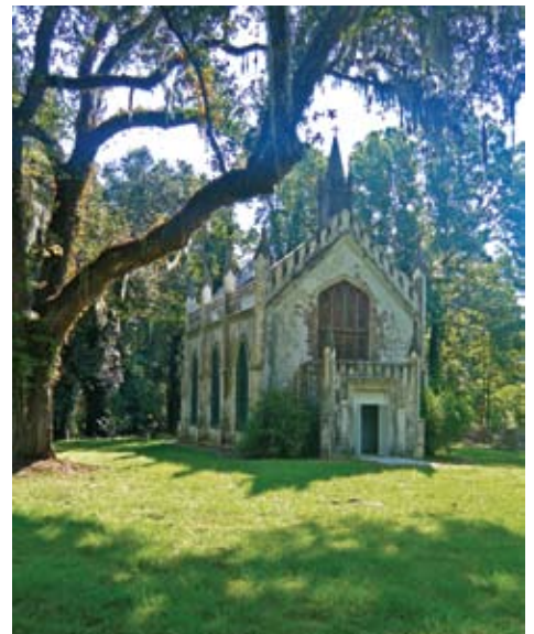
CHAPEL AT LAUREL HILL PLANTATION