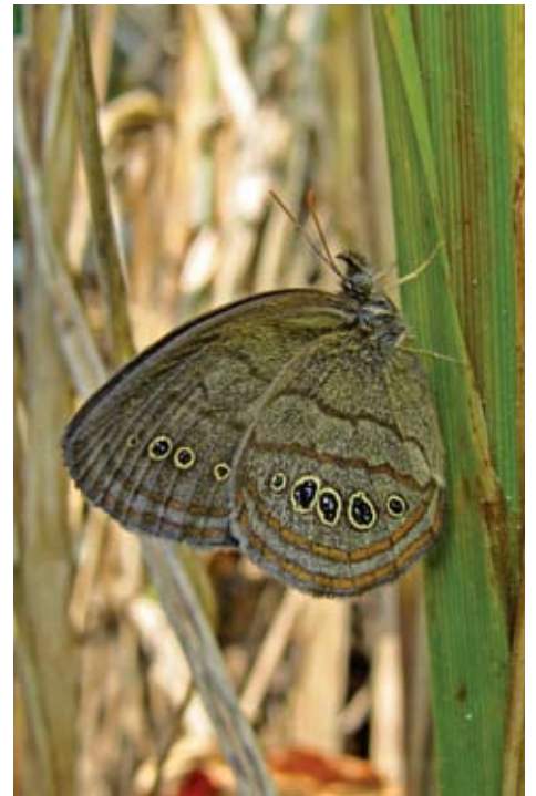
MITCHELL'S SATYR BUTTERFLY

In 2004, Mississippi State University entomologists identified the first two known Mitchell's Satyr populations in Tishomingo and Prentiss Counties, Mississippi. Until this time, this species was thought to only occur in Indiana, Michigan and Alabama.