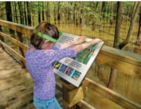
TAKE A NATURE HIKE ON THE 2.5 MILES OF NATURE TRAILS