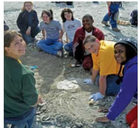
TEEN VOLUNTEERS WORKED ON UNCOVERING FOSSILIZED SEA TURTLE REMAINS