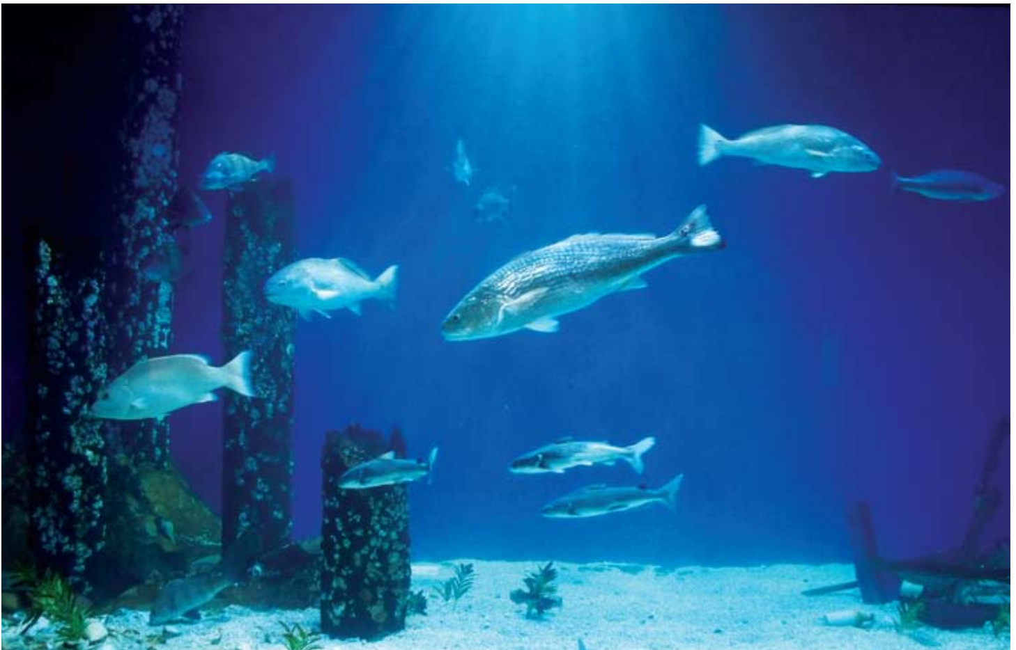
MISSISSIPPI SOUND AQUARIUM