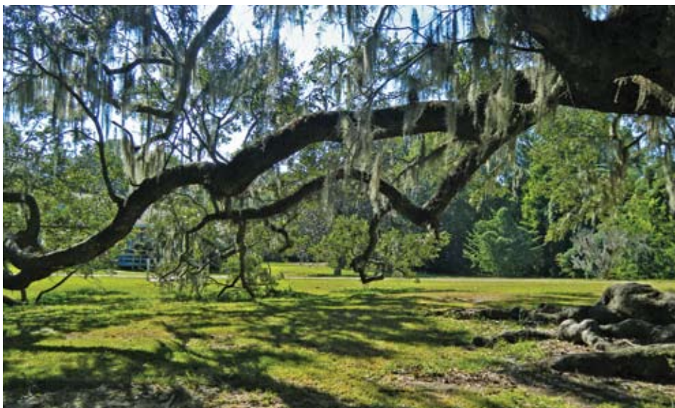
OAK ON THE GROUNDS OF JEFFERSON COLLEGE