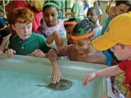
EXPERIENCE LIVE ANIMAL PRESENTATIONS BY MUSEUM STAFF