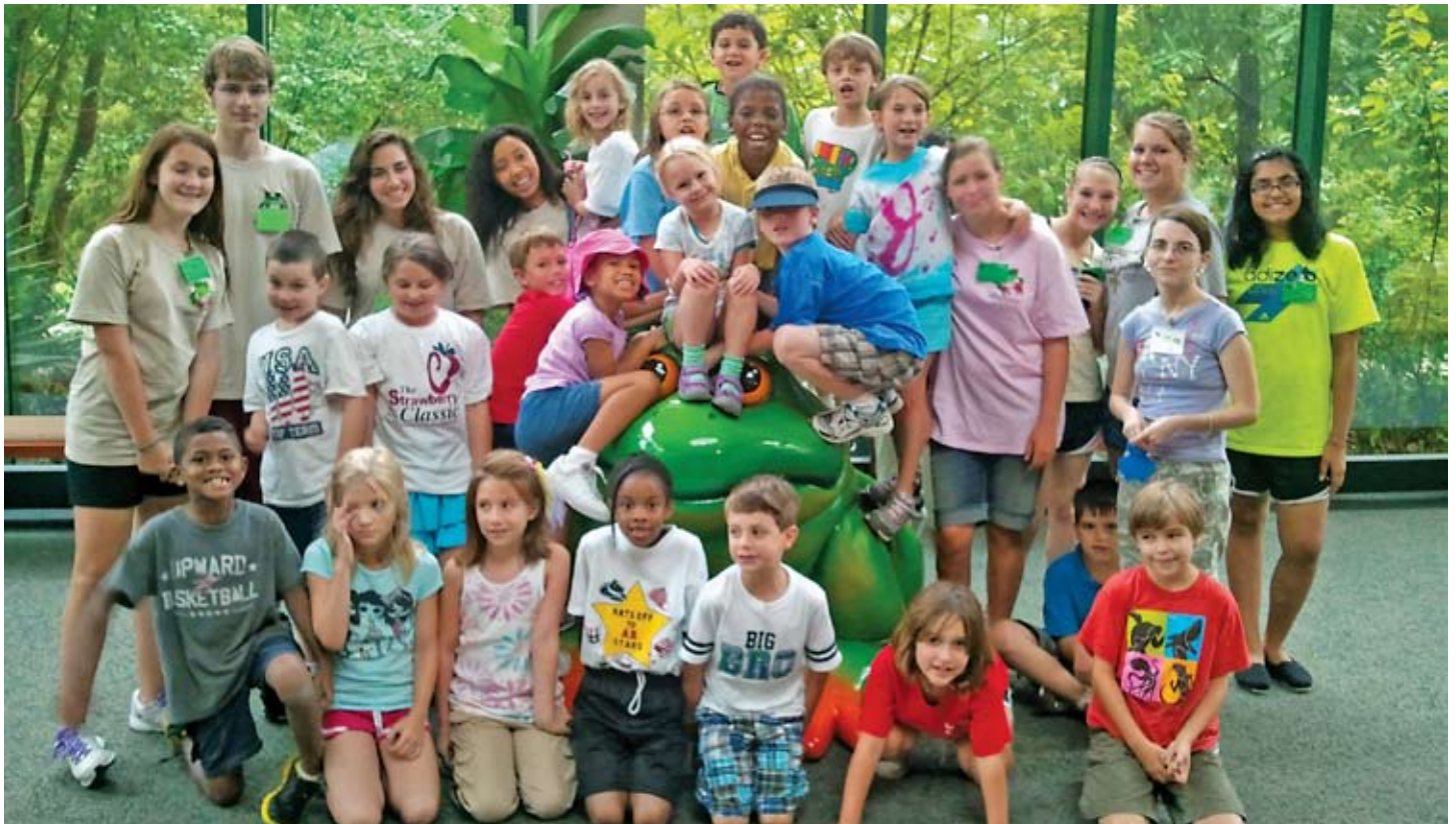
2011 CAMP WILD

New friends, crafts, games, and outdoor investigations will make this summer fun and exciting! Camp WILD, our half-day camp for 5 year old Kindergarten through 5th grade, will focus on the ecosystems of Mississippi and Jr. Naturalist Camp, our ecology based camp for 6th-9th grade, will focus on the identification, collection, and conservation of our native species. Mississippi Museum of Natural Science Foundation family member registration begins February 1 st and non-member registration begins March 1 st . Please check our website for registration forms and additional information on camp dates and fees, beginning February 1 st . Go to www.msnaturalscience.org for more information.