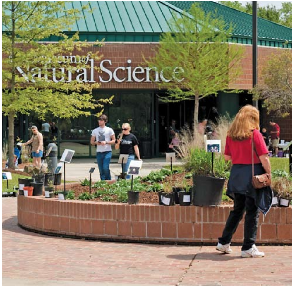
BRING HOME A PLANT FROM OUR MISSISSIPPI NATIVE PLANT SALE