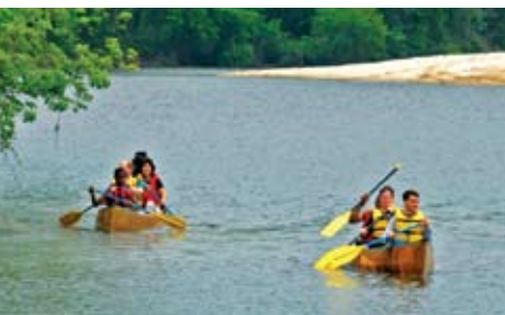
TRY YOUR HAND CANOEING ON THE PEARL RIVER