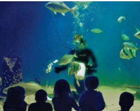
WATCH DIVERS FEED THE FISH IN THE GIANT AQUARIUMS