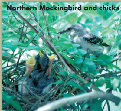
Northern Mockingbird and chicks

Red-shouldered Hawk Red-tailed Hawk Red-winged Blackbird Ring-billed Gull Ring-necked Duck Rock Pigeon Rose-breasted Grosbeak Ruby-crowned Kinglet Ruby-throated-Hummingbird Scarlet Tanager Sedge Wren Solitary Sandpiper Spotted Sandpiper Summer Tanager Swainson's Thrush Swainson's Warbler Swamp Sparrow Tennessee Warbler Tree Swallow Tufted Titmouse Veery Warbling Vireo White-breasted Nuthatch White-crowned Sparrow White-eyed Vireo White-throated Sparrow Wild Turkey Winter Wren Wood Duck Wood Thrush Worm-eating Warbler Yellow-bellied Sapsucker Yellow-billed Cuckoo Yellow-rumped Warbler Yellow-throated Vireo