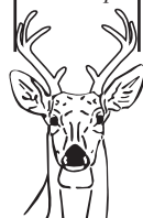
10" Inside Spread

Estimating a 10 inch spread is accomplished by observing a buck's ears in the alert position. When in the alert position, the distance from ear-tip to ear-tip measures approximately 14 inches. If the OUTSIDE of each antler beam is 1 inch inside the ear-tip, the inside spread is approximately 10 inches.