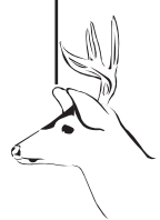
13" Main Beam

To estimate a 13 inch main beam, the buck's head must be observed from the side. If the tip of the main beam extends to the front of the eye, main beam length is approximately 13 inches.