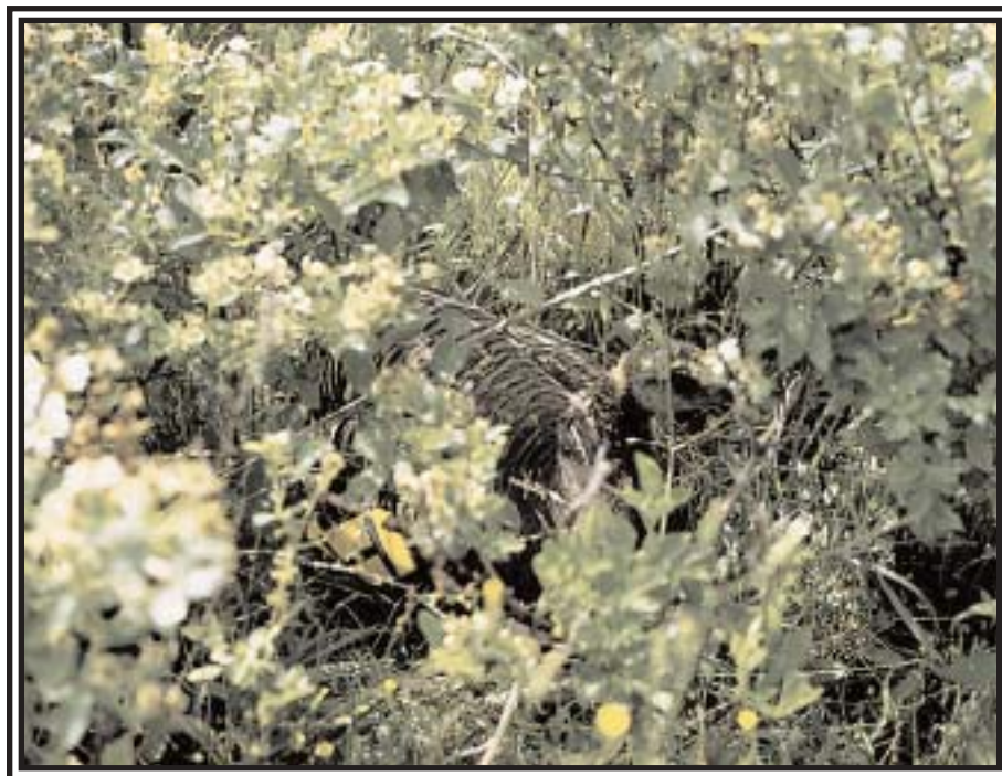
MARCIA W. GRIFFEN

The most important turkey use of ROWs is for reproduction. Several studies have found that many hens selected old field vegetation on ROWs for nesting. If the plant community adjoining a ROW is mature, uncut, hardwood forest, then there probably is little or no suitable nest habitat. Most hens will seek a plant community with a rather dense ground layer of vegetation—an old field—a ROW. Vegetation on ROWs can also serve as good brood-rearing habitat. A multitude of insects, berries, and seeds with protective overhead cover is what a hen seeks to raise her brood. She will probably stay around the edge of the ROW, where the forest and ROW adjoin. Poults can venture onto the ROW searching for bugs, and the woody vegetation on the edge will afford them escape and protective cover, and cool shade. So, ROWs can provide the most important habitats, those