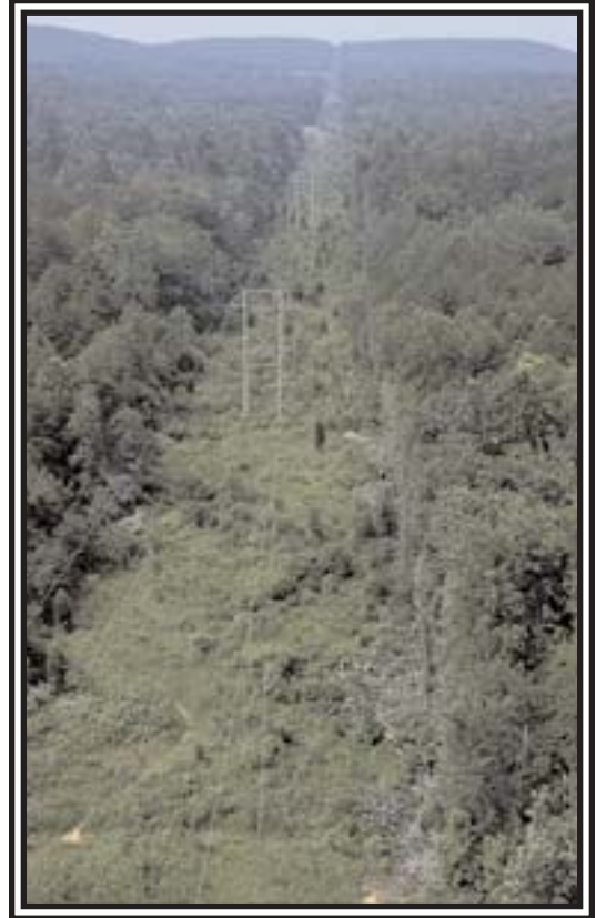
AMERICAN ELECTRIC POWER

Vegetation = habitat = wildlife! So, plant community structure (height, number of layers), density (number of stems) and species com-