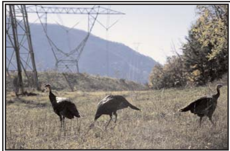
Wild turkeys frequently use ROWs.

There is another nonforest habitat often used by turkeys—old fields. These are abandoned agricultural fields. Farmer Brown moves to the city and his agricultural fields are no longer worked; they revert to natural plant communities, old fields, and eventually forests.