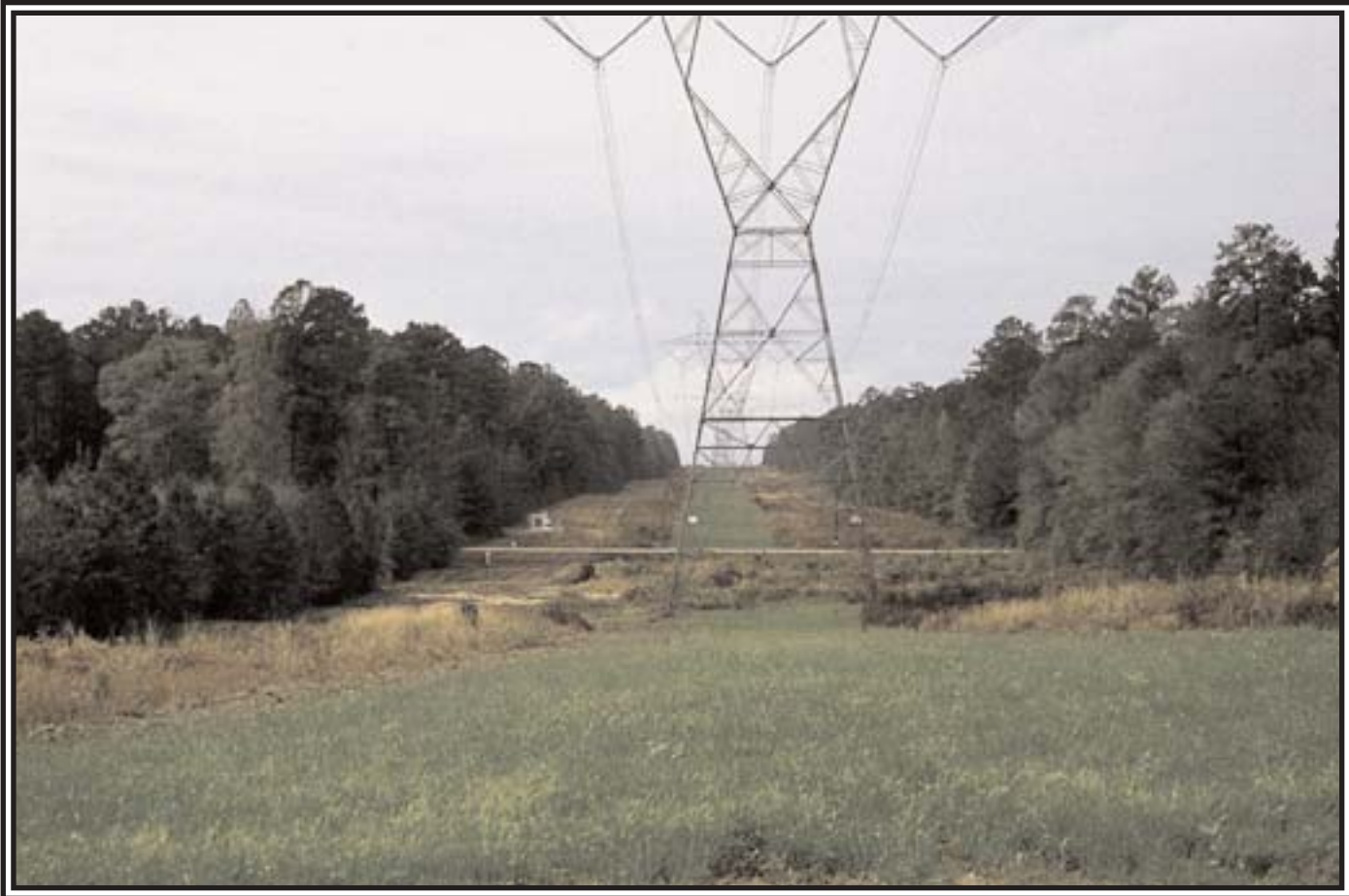
ROWs add diversity to the landscape.

position or richness are the primary factors. Utility companies must eliminate tall trees from ROWs. Trees are a hazard, they could eventually “reach” into the lines and cause power outages and destruction. Vegetation is also managed to permit safe access for line crews to make repairs. Safety and efficient delivery of energy are paramount considerations—wildlife habitat and wildlife are secondary. We can accept this.