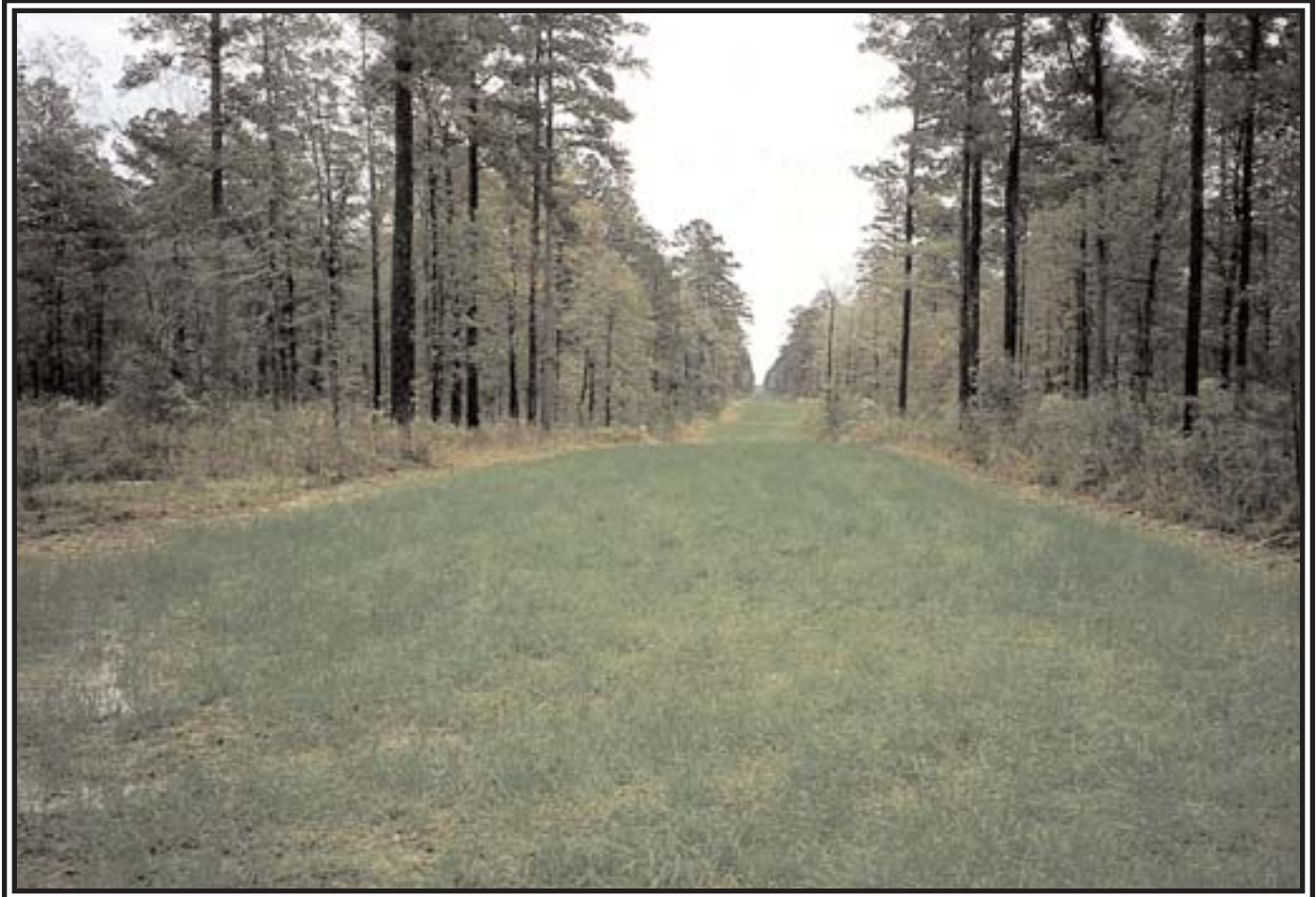
A pipeline ROW planted in a grass/legume mixture.