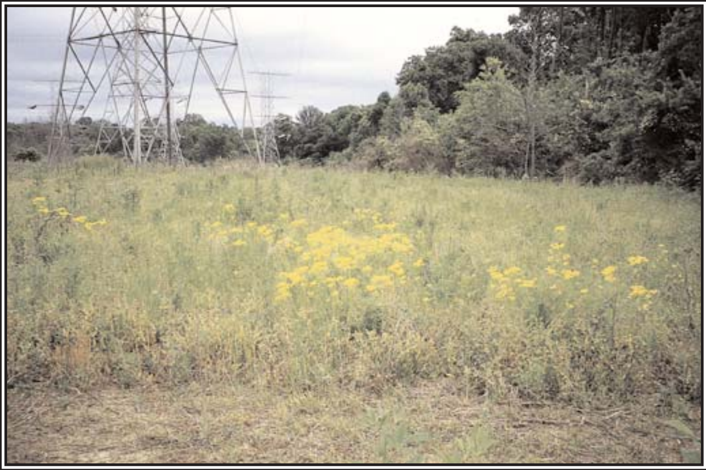
Proper use of herbicides can create excellent wildlife habitat.

best way to control the vegetation and improve wildlife habitat along each ROW. The program provides a number of benefits to each member company, which includes helping communicate the good things being done for wildlife and their habitats. Check out the Energy for Wildlife topic under the Conservation heading at www.nwtf.org and find out how a company can become a member. Also, find out how you can help and also benefit from the program.