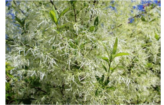
Leaves and blooms