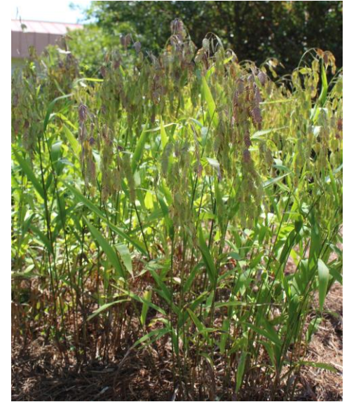
River oats plant