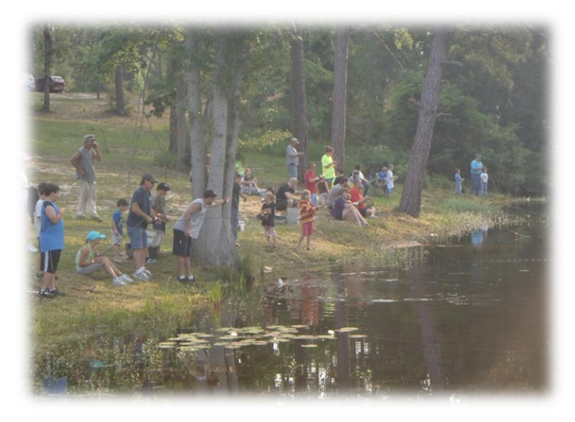
Left, Below: The annual Fishing Rodeo at Paul B. Johnson State Park draws youth from the area to learn the joy of fishing.