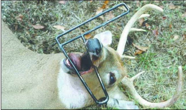
Step 1. Insert the jawbone extractor between the jaw and roof of the mouth and then, rotate the extractor to pry open the mouth.

Take all other measurements from the deer and record the data on the jawbone card, then remove the jawbone. If processing more than one deer, be certain to match the proper jawbone to the card with the data from the same deer. The best and easiest way to remove a jawbone is with a jawbone extractor. You can simply cut the jawbone out, but it is much easier to use a jawbone extractor. The proper method for removing a jawbone with a jawbone extractor is illustrated in steps 1 through 8.