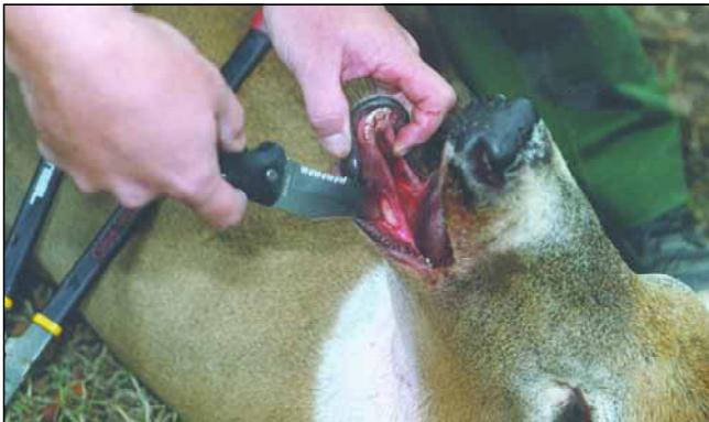
Step 3. Carefully cut the inner lip near the top of the jawbone between the front and back teeth. This step can be omitted if the deer will NOT be mounted by a taxidermist.