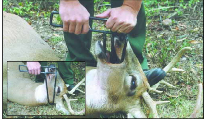
Step 2. Use the rounded end of the jawbone extractor to separate the muscles and hide from the jawbone by forcing the extractor downward between the jawbone and cheek. This will take a moderate amount of force. The inset shows the extractor in the position needed for complete muscle separation.