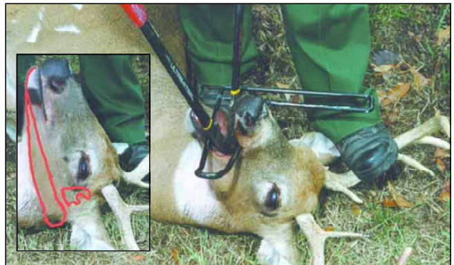
Step 4. Insert the jawbone extractor between the jaw and the roof of the mouth to pry open the mouth as shown in step 1. Insert the clippers between the two bars of the extractor and cut the jawbone at the back of the mouth. The inset shows where the jawbone should be cut.