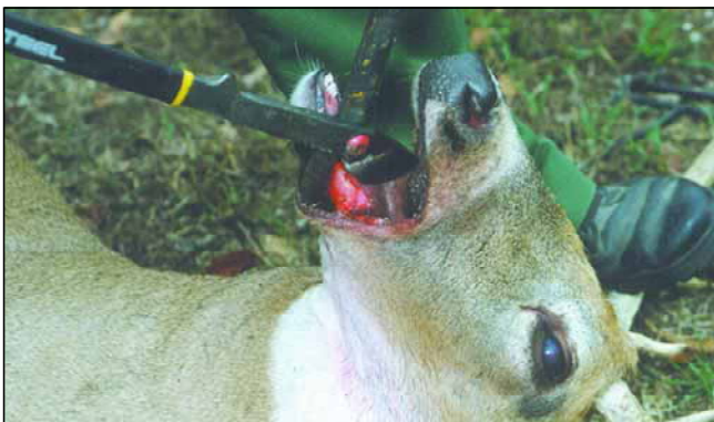
Step 7. Cut the jawbone between the front and back teeth. Be careful not to cut the lip if the deer is to be mounted by a taxidermist.