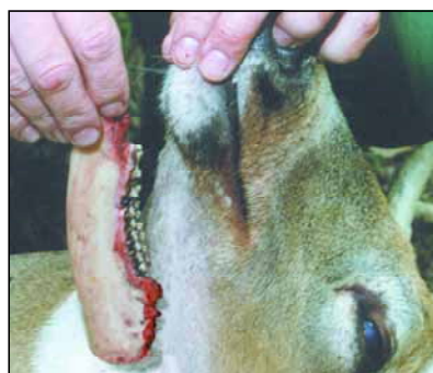
Step 8. Remove the jawbone.