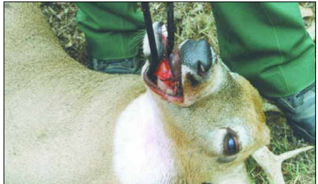
Step 6. Position of extractor after pulling it under the jawbone of a deer that is to be mounted. For deer that will NOT be mounted you may choose to pull the extractor completely under the jawbone and out the mouth breaking the bone at the front teeth.