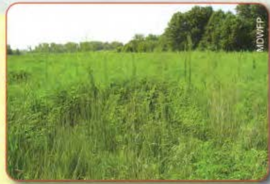
This is the same field pictured 15 months following planting. This restored prairie offers excellent nesting and brood-rearing cover for bobwhites and rabbits.

continue working with private landowners and to further expand the partnership to acquire additional funding for restoration. "The participation of private landowners is critical to this effort" says Coggin. "We hope to continue to work together to provide assistance for landowners interested in resorting and managing prairie habitat to benefit bobwhites and other wildlife." Thus far, the initiative has restored more than 10,000 acres of prairie grasslands in the Black Belt Region of Mississippi and Alabama.