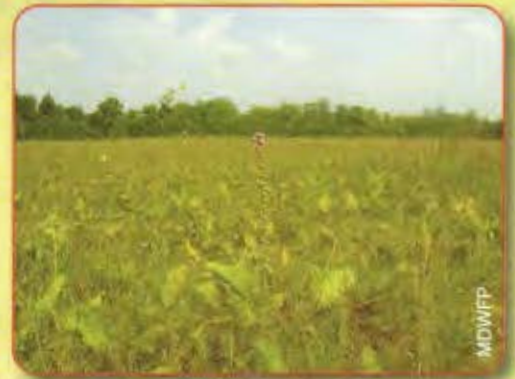
Botanists documented 448 plants on this 200-acre prairie remnant in Chickasaw County Mississippi.

prairie grasslands, on the other hand, are ecologically suited to remain grasslands regardless of man-made disturbance. Under historical conditions, these grasslands would have remained open as a result of frequent natural fires and grazing by large animals, such as the American Bison and others. Both man-made and natural grasslands provide critical habitat for bobwhites and other wildlife.