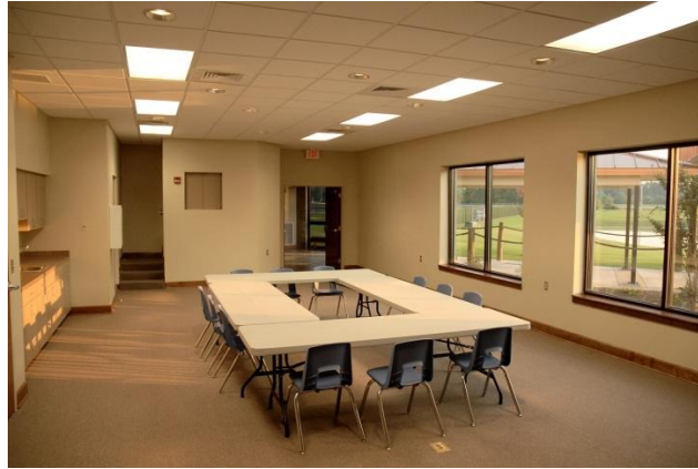
Interior dividable conference room with seating capacity for up to 70 people for meetings and conference engagements.