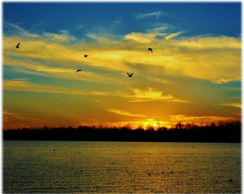
Right: A beautiful view from the levee front at Lake Ferguson.