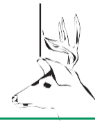
13" Main Beam

To estimate a 13 inch main beam, the buck's head must be observed from the side. If the tip of the main beam extends to the front of the eye, main beam length is approximately 13 inches.