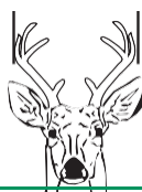
10" Inside Spread

Estimating a 10 inch spread is accomplished by observing a buck's ears in the alert position. When in the alert position, the distance from ear-tip to ear-tip measures approximately 14 inches. If the OUTSIDE of each antler beam is 1 inch inside the ear-tip, the inside spread is approximately 10 inches.