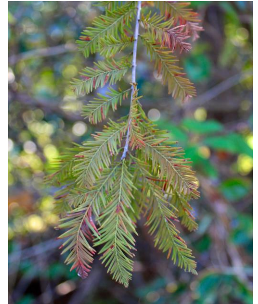
Bald cypress leaves

The VEC promotes the sport of freshwater fishing in Mississippi, and encourages the conservation and stewardship of aquatic resources. The facility offers guided and self-guided tours along with a myriad of programs and workshops for the public.