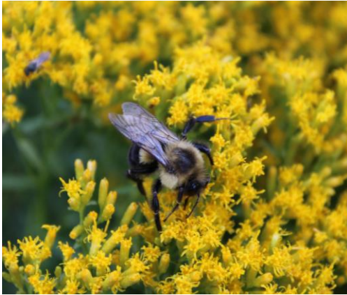
Attracts bees (honey and bumble)