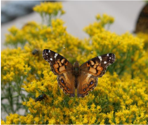
Flowers in full bloom