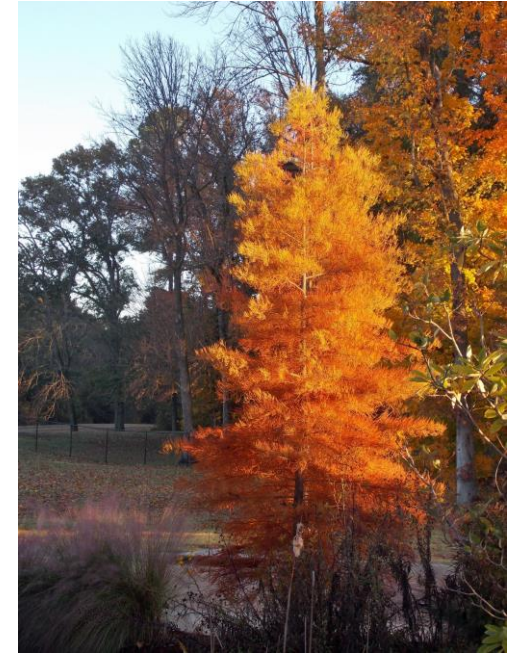
Pond cypress in the autumn