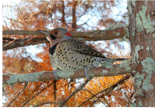
Perched in the cypress

This cypress is found in various wetland habitats.