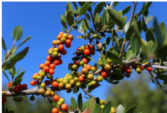
Berries turning red

Deciduous Holly, Swamp Holly, Bearberry, and Winterberry