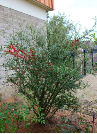
Bush approximately 7 foot tall