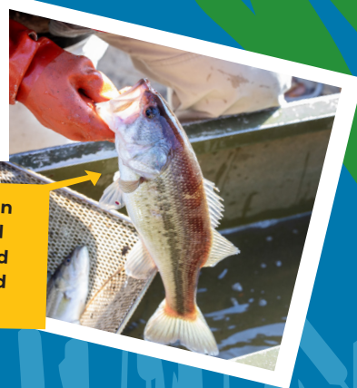
The fish are then easily collected and studied, and quickly returned to their home!

S V M F C K N T O P C W M A P L E S A C Y P E D G D U K K E P I H E R N M R X D R N O I T U O U S A E E L R C G T L T R S G L J F K U U I T S Z Y X A G O M K A N B E E C H D R A T B U O N J P J S Y G