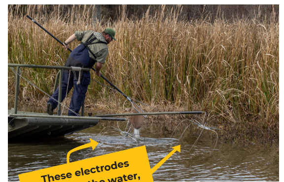
These electrodes hang into the water, sending out electric current and stunning nearby fish.

By doing these surveys, they ensure our public waters are well stocked for Mississippi anglers to enjoy!