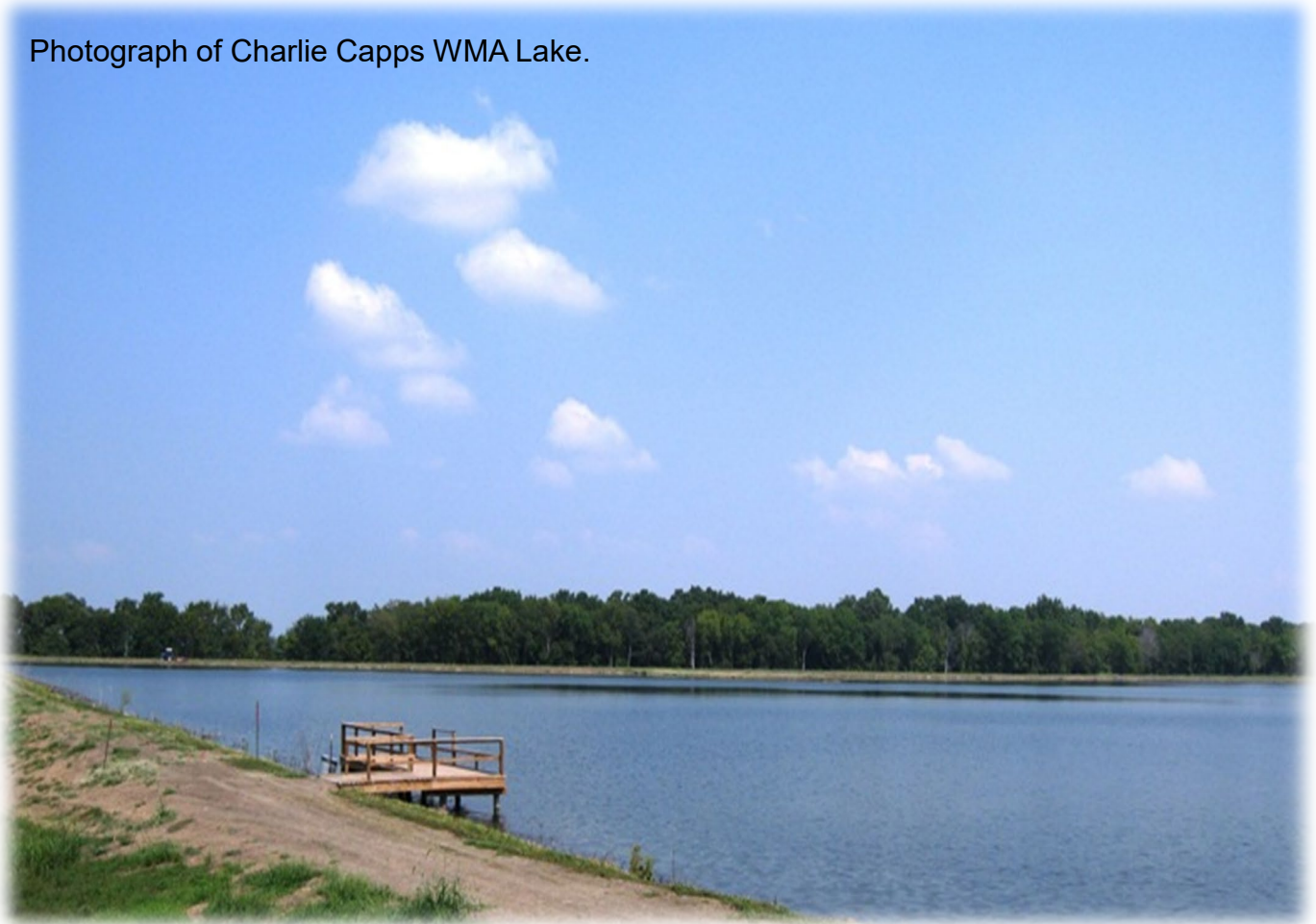
Photograph of Charlie Capps WMA Lake.